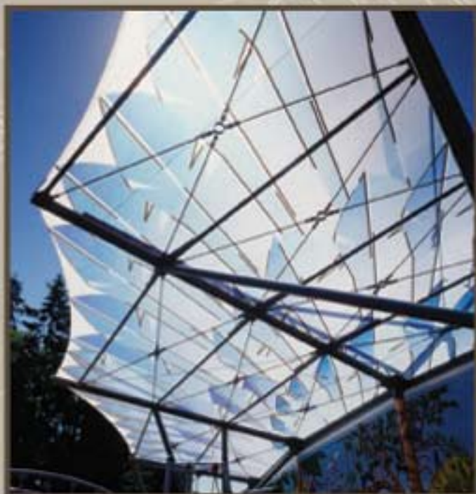
Point Defiance Zoo & Aquarium Tacoma, WA