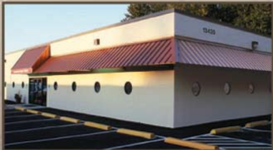
Backstage Dance Studio Metal Awnings Bellevue, WA