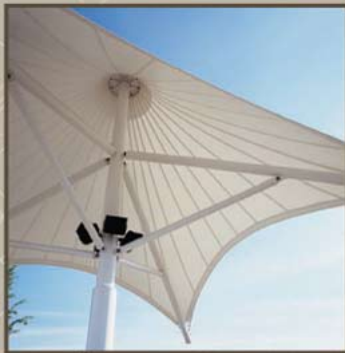
Tulip Casino Tulalip, WA