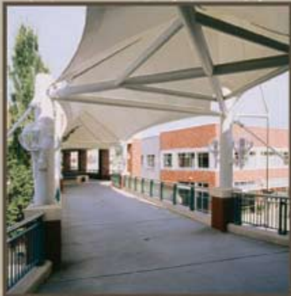
Redmond Town Center Tensioned Structure Redmond, WA

Our qualified team will work with you to develop a custom-built structure to meet any requirement. Elegant and graceful tensioned structure solutions by Rainier enhance public and private settings across the United States.