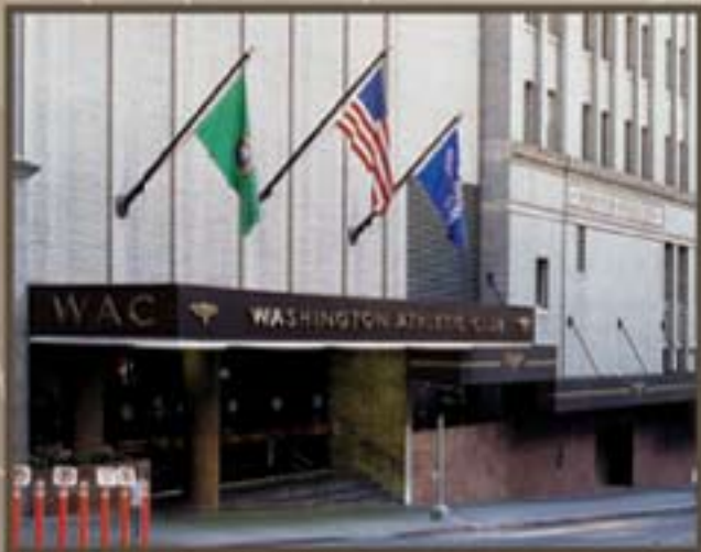
Washington Athletic Club Metal Awnings Seattle, WA