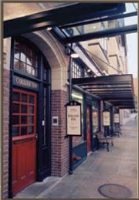
College Inn Glass Awnings Seattle, WA