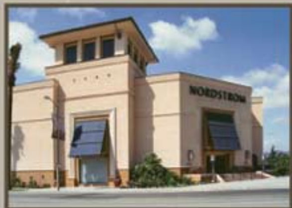
Nordstrom Hollywood, CA