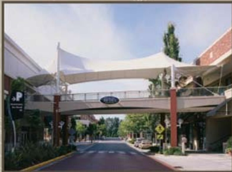
Designer: KPFF Consulting Engineers