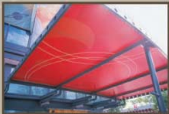
Seattle Space Needle Ticket Booth Canopy Seattle, WA Designer: Hornet Anderson Design