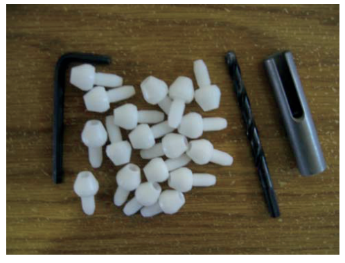
Keder Bullet Install Kit