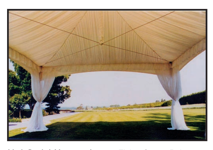
High Peak / Marquee Liner. – Flying Center Pole, High Peak, Marquee, and Hex styles are all available.

Distinct style options give you the choice of either smooth or directionally pleated designs. With Baytex liners you have the advantage to choose the style best suited to your special event..