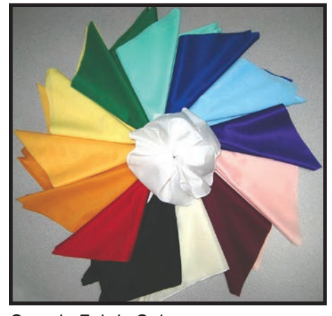
Sample Fabric Colors

Color adds an additional dimension to event décor. Complete liners, leg drapes and sidewall curtains can be made to order in your choice of color.