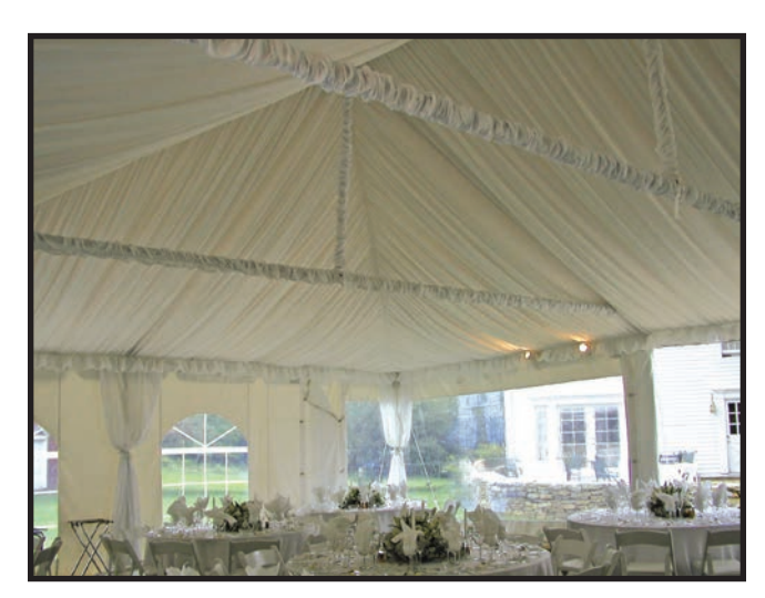
Brace Bar Covers

Baytex Tent Liners – provide the background for displaying the finished touches to make a party spectacular. The decorator can then add color, lighting, floral design, and special accents to set the theme for any occasion. Liners transform any interior to one with warmth, character and class.