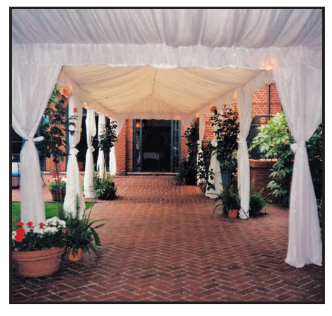
Leg Drapes – provide a variety of decorating options. Fully bloused or straight tailored, the drape conceals the tent leg, tent rigging, electrical and decoration hardware for a totally finished appearance.