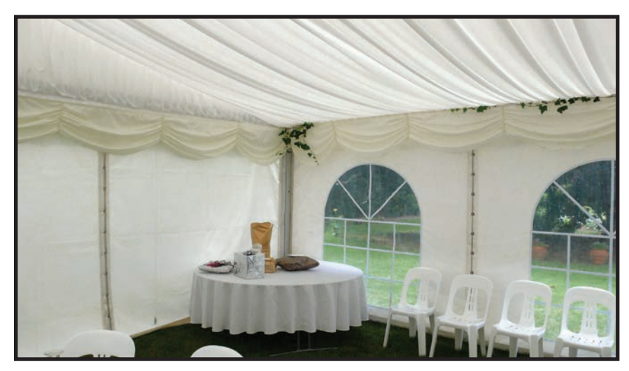
Removable Valances and Swags