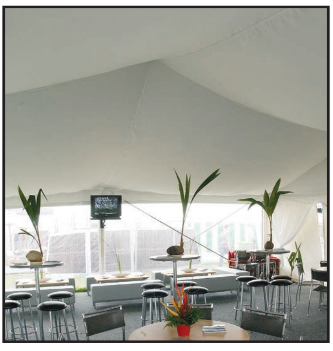
Smooth Tent Liner