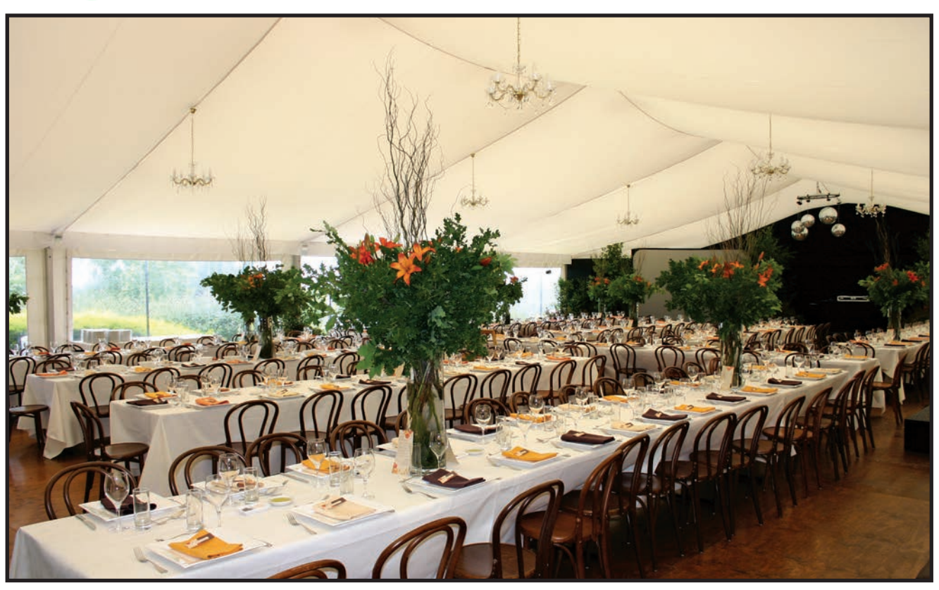
Imagine the Possibilities