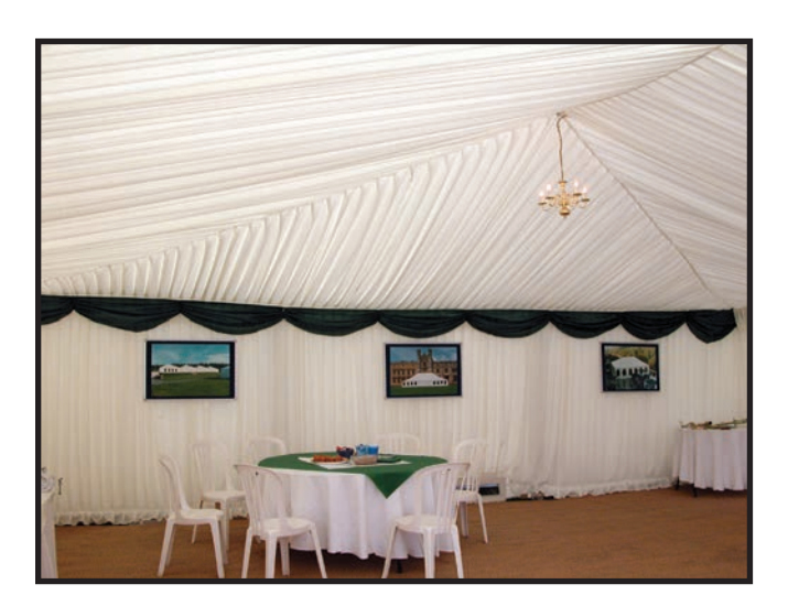
Side Wall Drapes