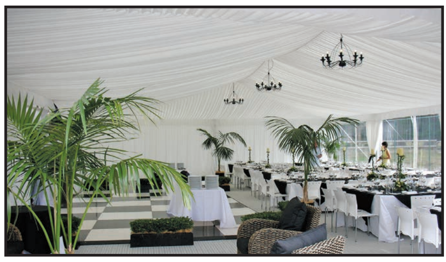
Frame Tent Liners